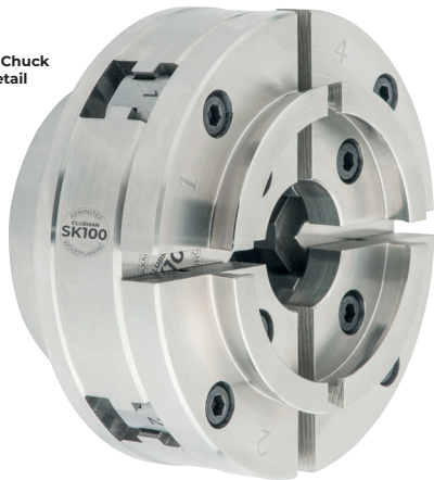
SK100 Clubman Chuck fitted with Dovetail Jaws Type C

For more information and to see all the latest accessories visit axminstertools.com or call 03332 406406