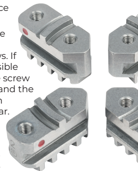
SK100 Accessory Mounting Jaws - Code 106818

Look out for the red dot on the side of all 4 jaws. If the dots are visible this means the screw is not in place and the jaws have been extended too far.