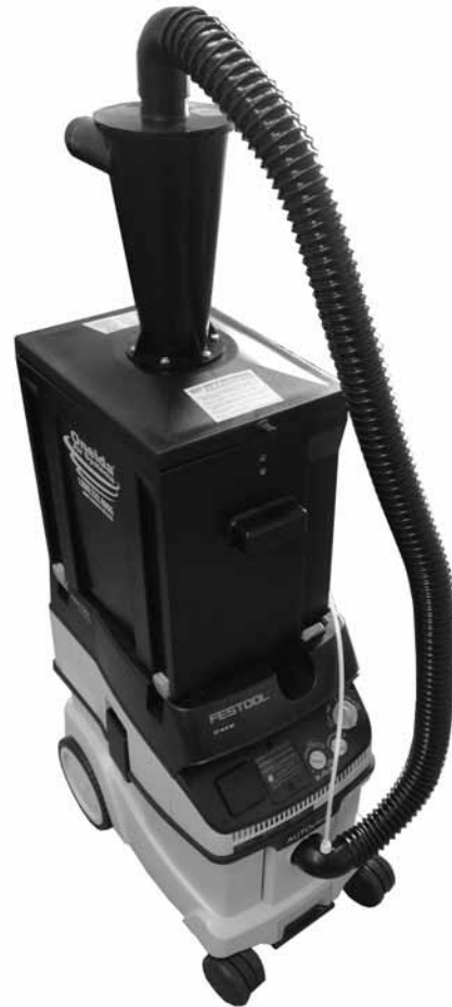
Fig. 12 - 2" hose between the Ultimate Dust Deputy and the Festool.

7. Run the 2" hose between the SD elbow without the fitting on the top of the Dust Deputy cyclone and the elbow with the fitting on the Festool as shown in Fig. 12 below.