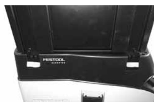
Fig. 6 - Festool latches C & D opened.

4. Secure the two latches that open on the other side of the Festool over the Ultimate Dust Deputy tabs. Figs. 6 & 7 below.