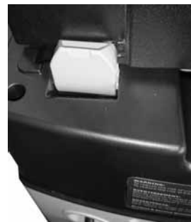
Fig. 5 - Festool latch locked in place.

The latches fit into notches on the Ultimate Dust Deputy box.