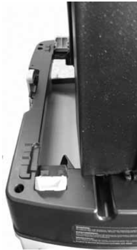
Fig. 3 - Festool latches A & B open

3. Close latches A&B first over the Ultimate Dust Deputy box tabs. Figs. 3 & 4 & 5 below.