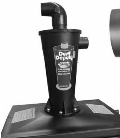
Fig. 10 - SD Elbow without fitting attached to cyclone outlet.

6. Attach the SD elbow without the fitting (AXD600103) to the outlet of the Dust Deputy. Figs. 10 & 11 below.