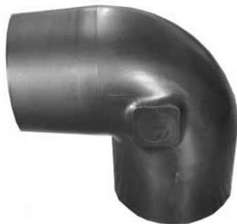
Fig. 11 - Elbow without fitting (AXD600103)

7. Run the 2" hose between the SD elbow without the fitting on the top of the Dust Deputy cyclone and the elbow with the fitting on the Festool as shown in Fig. 12 below.