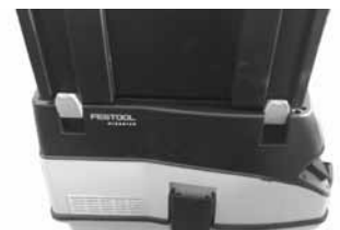
Fig. 7 - Festool latches C & D closed.