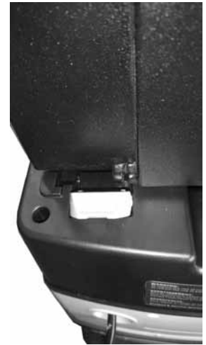
Fig. 4 - Dust Deputy tabs lined up with Festool latches A & B