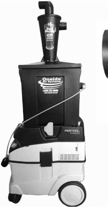
Fig. 8 - 1/4" tubing connected

5. Run the 1/4" tubing across the Ultimate Dust Deputy to the SD elbow with fitting (AXD600104) on the Festool. Figs. 8 & 9 below.