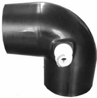
Fig. 9 - Elbow with fitting (AXD600104)

6. Attach the SD elbow without the fitting (AXD600103) to the outlet of the Dust Deputy. Figs. 10 & 11 below.